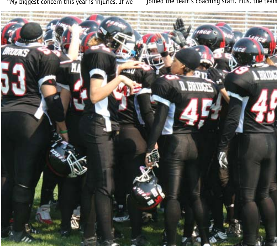
The Chicago Force after a game last year.